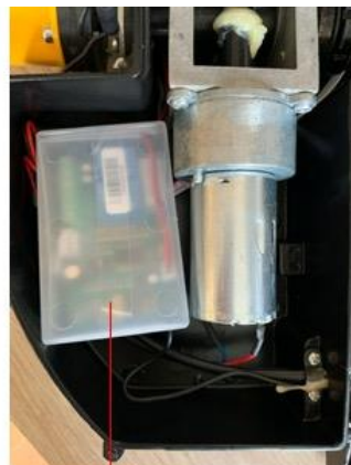
CIRCUIT BOARD BOX