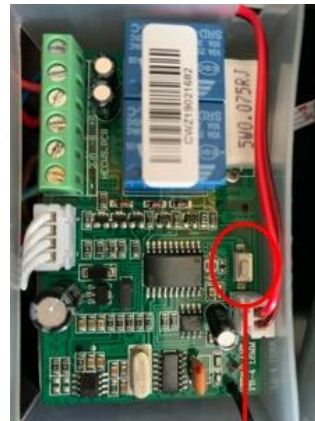
BLACK OR WHITE RESET BUTTON