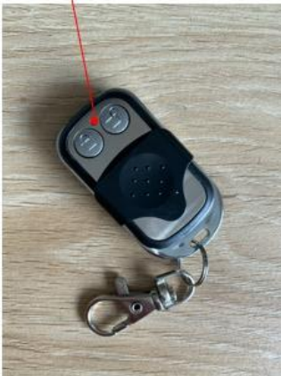
REMOTE CONTROL INDICATOR

Repeat STEP FIVE for all remaining remote controls, then repeat Steps 1 - 3 in reverse.